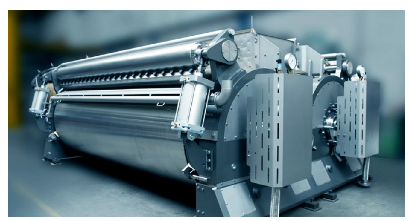
ANDRITZ Gouda double drum dryer

When brewing beer, yeast is produced as a by-product. This product is usually treated as waste. Brewer's yeast, however, contains valuable ingredients, such as amino acids, proteins, and minerals. These ingredients can be re-used in several food products. For this purpose, ANDRITZ has developed an efficient drying process.