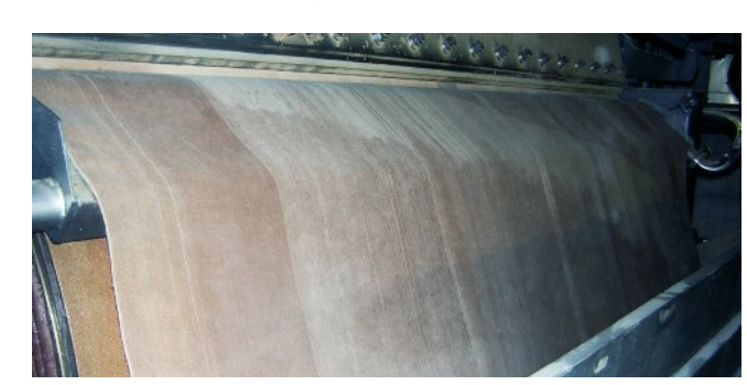
Dried yeast on the drum dryer

Compared to direct drying processes, indirect drying on an ANDRITZ Gouda contact drum dryer requires less hot air to achieve evaporation. The heat is generated by steam, for instance, and the (metal) wall of the drum transfers the heat to the product. The wall of the drum ensures that all the heat is used to dry the product and does not leave the machine or chimney unused. This makes indirect drying a much more efficient process. An added advantage is the fact that large dust recovery systems (such as filters) are no longer necessary because there are no large amounts of drying gas. To ensure low emission values, it is recommended to clean the exhaust vapors in a small biofilter before releasing them into the atmosphere.