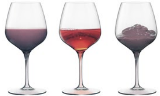
Left to right: feed, permeate, retentate