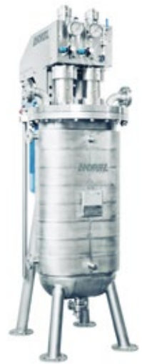
Krauss-Maffei dynamic crossflow filter DCF